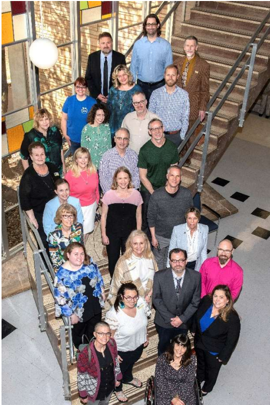
2019-2020 Faculty Senators completing service: