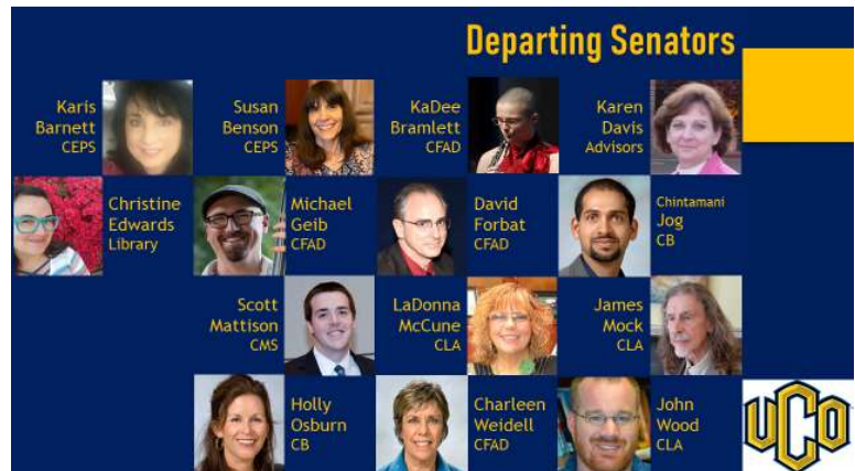
2019-2020 Faculty Senate Executive Team: